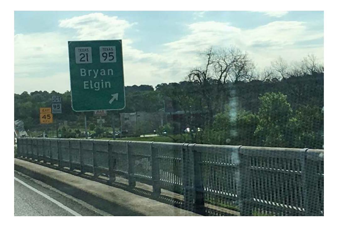
Take the Texas 21 / Texas 95 exit.

Here's driving directions from Austin with photos of key landmarks. Take Hwy 71 east to Bastrop. As you are crossing over the river, you'll see the sign for the Texas 21 / Texas 95 exit.