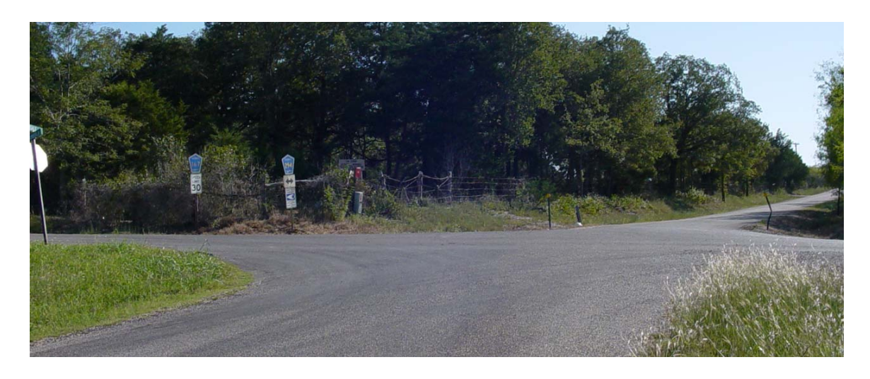
Turn left on CR 167 and drive 1.5 miles. Along the way you will cross a one lane bridge.