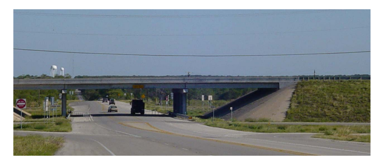
Continue on FM 812 past the "smiley face" water tower (photo)

You will cross Highway 21 (overpass) about half way down the 16 mile drive.