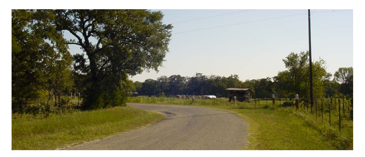
After CR168 curves to the left, turn into the 1st driveway on the left. You will see the Schaefer banner on the gate.

Turn right on CR 168. It will make a sharp left curve.