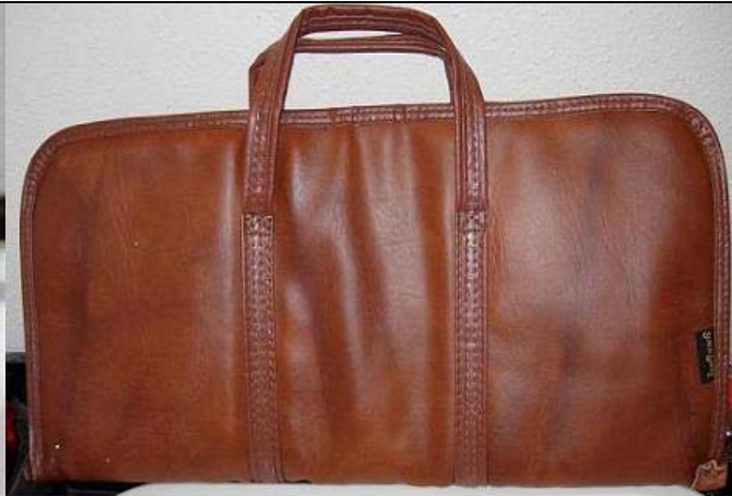
Red Loctite, full bottle (decided not to use)- $8 1911 backstrap, serrated, blue steel- $20 Gun rug, 10 inches X 20 inches- $10