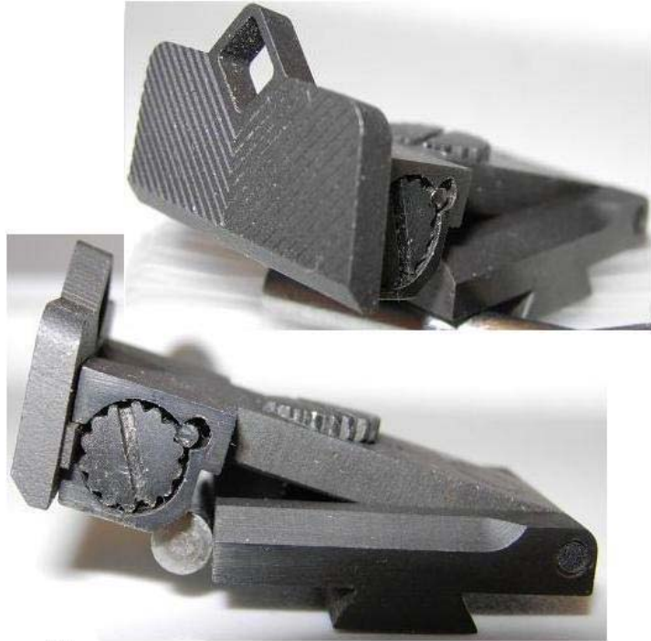
Bo-Mar style "ghost" rear sight from Caspian Arms- $40